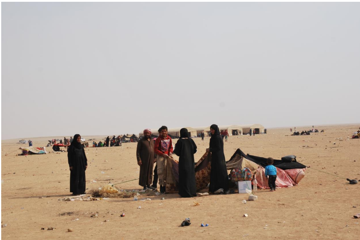
IDPs who try to build a small tent by using some sheets in Rajm Al Slaibi