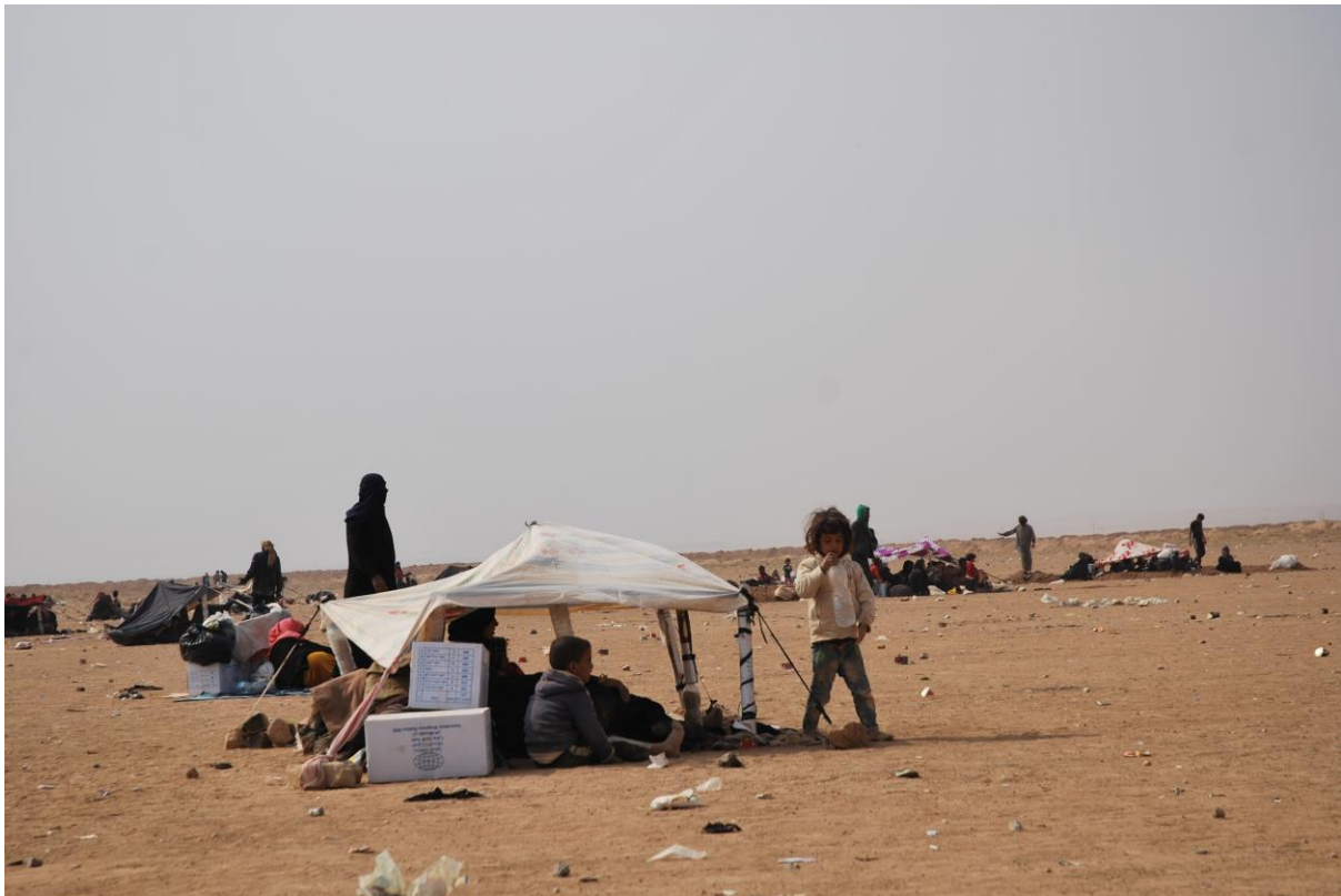
IDPs sleep on bare land in Rajm Al Slaibi

The United Nations declared 1 in April 2 nd 2017 that the current war in Syria caused displacement of 13.5 million people including those who were displaced inside Syria many times. This rates Syria on the top of the list of internally displaced people. Such case of displacement with this enormous number has a parallel prison which is imposed on the civilians by some dominating forces on the ground, especially in eastern Syria. Deir Ezzor, Al Hasakeh and Al Raqqa have close nature, dialects, traditions and tribal society. All of them was marginalized by the governing authority, which was considering them as “developing regions” before 2011 as they were characterized by the poverty of their locals and the simplicity of their style of life until the war-years among the belligerent forces imposed a geographic segmentation among their locals along with inhumane treatment among the tribe sons.