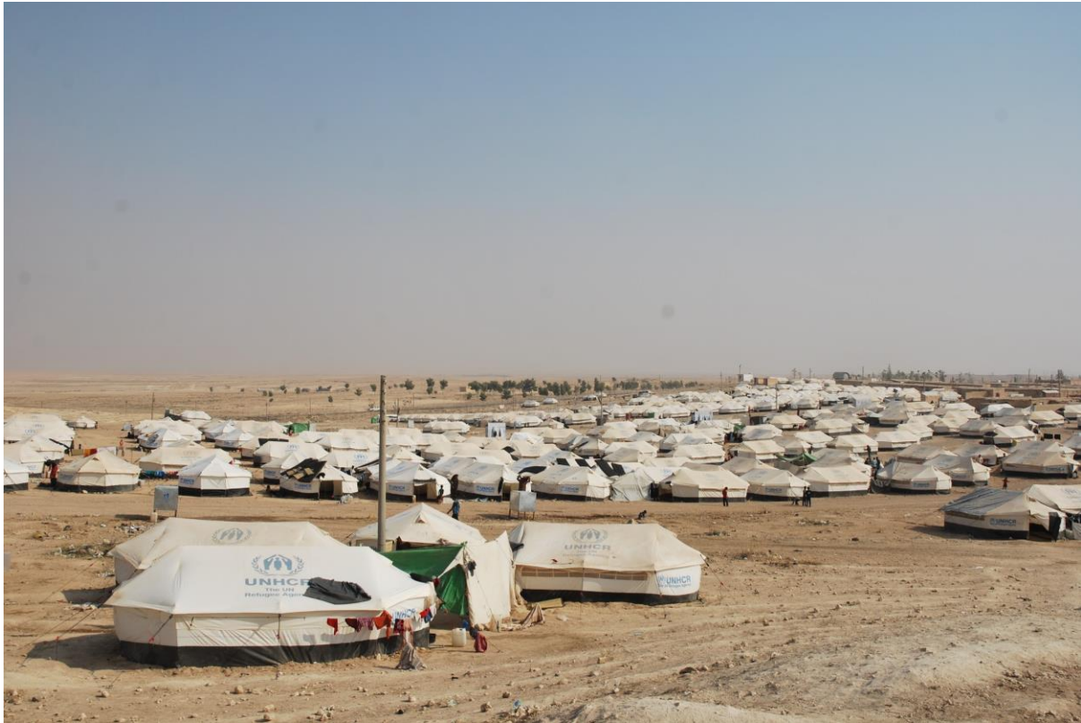
Al Hol Camp ( Justice for Life )

In early 1991 during the “Gulf war” or “Kuwait Liberation War”, the UNHCR established Al Hol camp nearby the Syrian-Iraqi border ( 50km east of Al Hasakeh city). In 2003, the camp was reopened during the war of US on Iraq. In April 2016, the camp was activated for hosting the Syrian IDPs along with Iraqi IDPs who flee “Islamic State” and the current war.