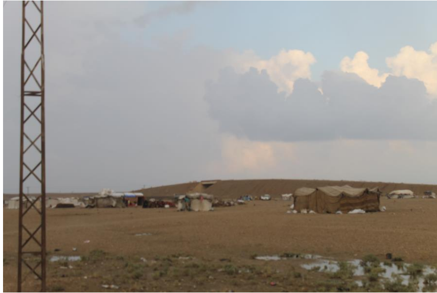
Mhaimeda Camp – November 5 th 2018.

A number of the camp residents told JFL correspondent that the humanitarian organizations do not pay attention to their conditions, except for one organization that distributed an amount of money to some families.