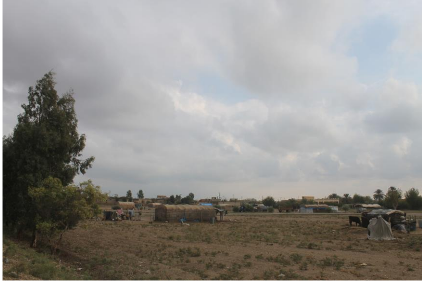
Hawaej Theyab Camp – November 5 th 2018