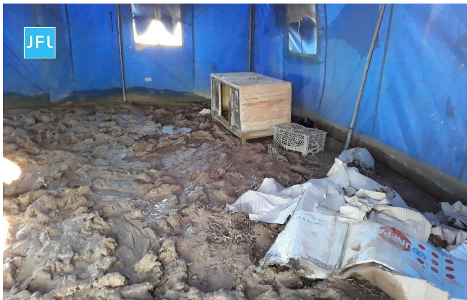
Damaged Tent by the Rain Storm in Abo Khashab Camp – October 26 th 2018

On October 26 th 2018, many tents were destroyed by the rain storm. It forced dozens of families to sleep outdoor for three days. International organizations provided (500) new tents.