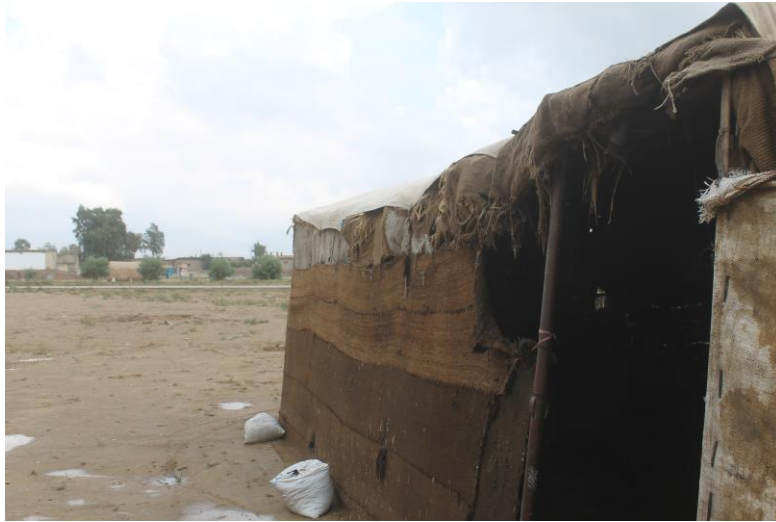
Torn Tent in Hawaej Theyab Camp – November 5 th 2018.