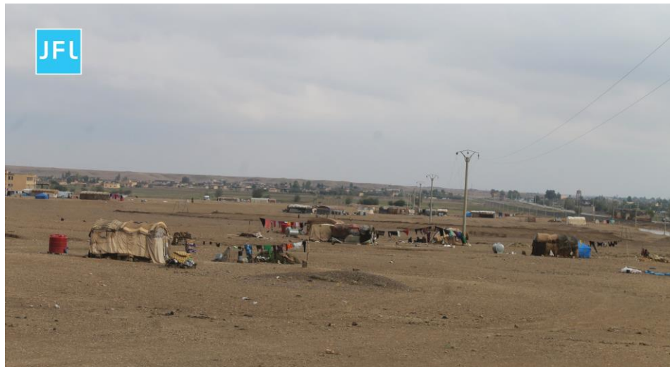
Zghair Camp – November 5 th 2018

A number of the camp residents told JFL correspondent that they suffer from poor tents that has been used for about one year. They also confirmed that they have not received any relief support for more than four months. Also, they stated that there are not medical services as the health centers are distant Al Kasra hospital, which is the nearest one, is 20km away from the camp.