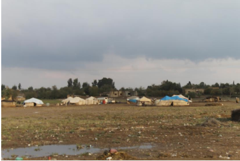
Al Ashawi Camp – November 5 th 2018.