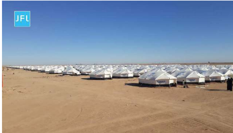
New Tents in Abo Khashab Camp – October 31 st 2018