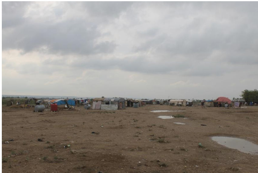
Hawaej Al Bumasa'a Camp – November 5 th 2018.

A number of the camp residents told JFL correspondent that a number of tents were torn away by the rain storm that hit the area on October 26 th 2018. They also confirmed that not humanitarian organizations paid attention to their suffering and they do not receive any humanitarian relief.